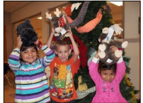
This is what Kiwanis is about - look at all the happy faces at ECEAP after the children were able to choose the stuffed toy of their choice from the boxes of toys we gave to them just before Christmas