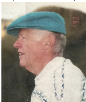
Onto the next course!!!