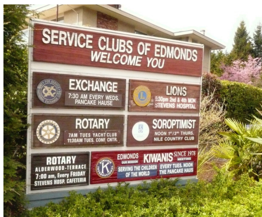
New Kiwanis sign on Puget Drive