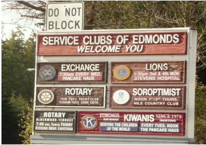
Our new sign on Edmonds Way