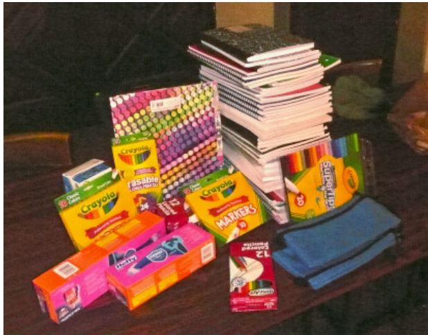
School Supplies for Chase Lake Elementary

Once again, thanks to the generosity of our members, we were able to help provide school supplies to those in need attending Chase Lake Elementary school. The above picture shows some of the items purchased... Thanks to all of you that were involved in this program.