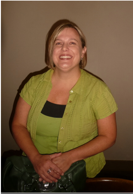
Service with a smile!!!