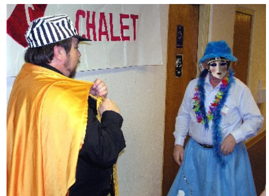
What's going on here?