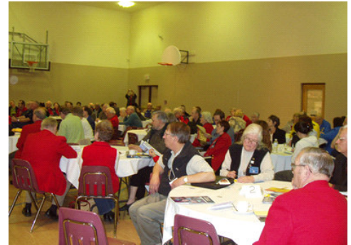
2007 Zone conference in BC

Kiwanis does have all the right tools, we need to continue the Kiwanis traditions. As active members we must promote Kiwanis by actively recruiting new members. Get busy today, solicit a non attending member, ask a friend or a stranger. Its for the good of Kiwanis which is good for America.