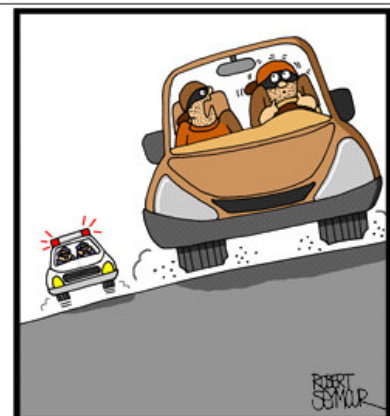
Take just the money? Noooooooo, you had to steal the doughnuts