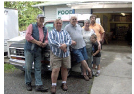
July 2007 The biggest BBQ yet