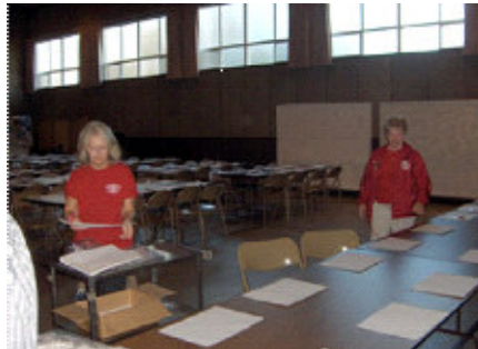
Oct. 2007 Spaghetti Feed