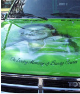
Aug. 2007, Who could forget this program?