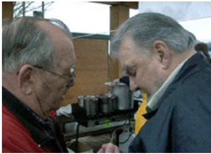
April 2007 the MS Walk