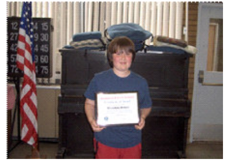
May 2007 The Dux Awards'