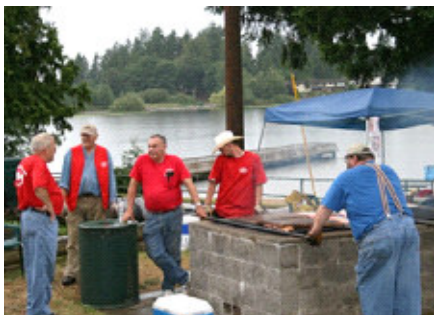
July 2007 The biggest BBQ yet