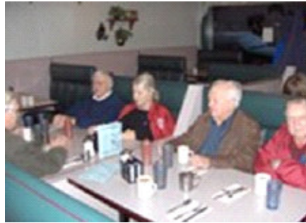
Feb. 2007 the Stanwood-Camano Interclub wound up in the Angel of the Winds