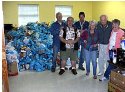
May 2007 the Post Office Food Drive