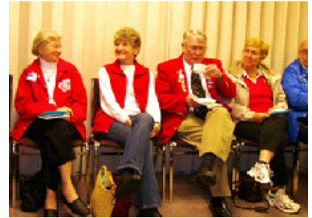
March 2007 Zone Conference