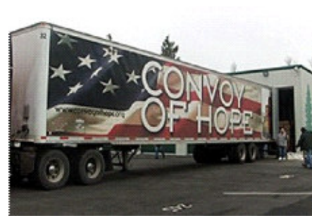
Dec. 2007 Christmas Food Bank delivery