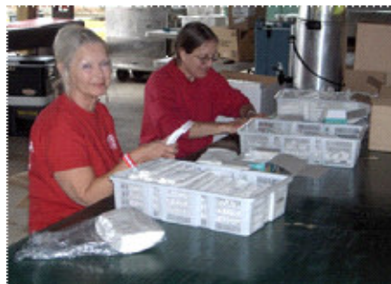
July 2007 The biggest BBQ yet