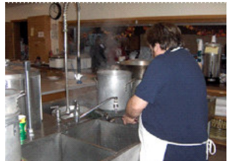
Oct. 2007 Joint Spaghetti Feed.