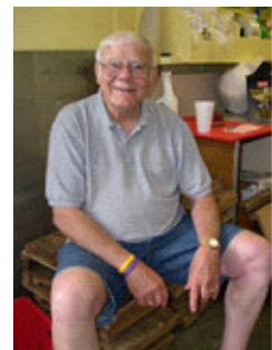
The King Fish cooked them well