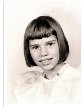
Who is it?