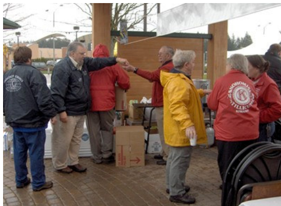
Some of the 14 "hard at work" behind the scenes.