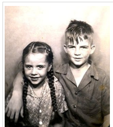
Who is it?