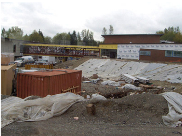
New elementary school. Do you think it will be ready by Fall???