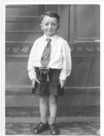
Who is this? See next month's newsletter.