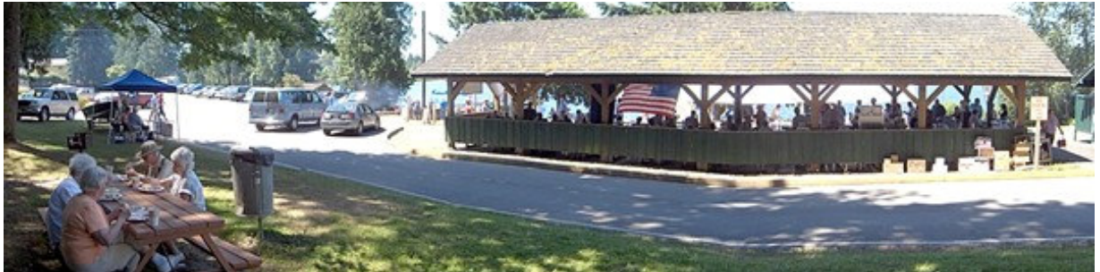
Panoramic view of the 2006 Salmon Barbecue - Jim Rahm