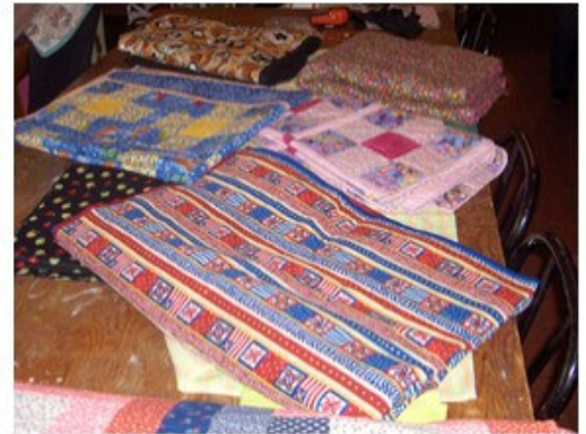
Some of the finished quilts.