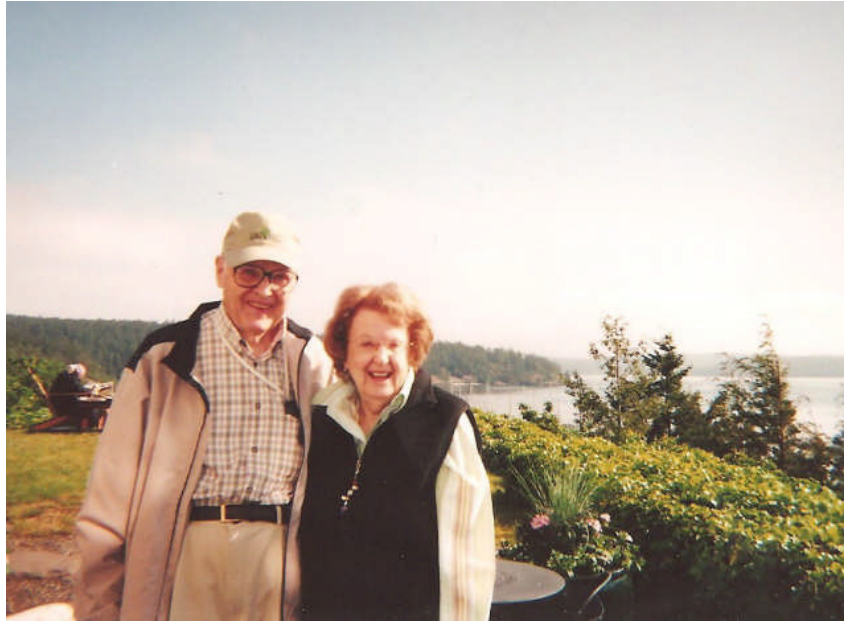
Celebrating 50 years at Friday Harbor