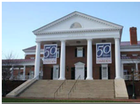
The Darden School of Business