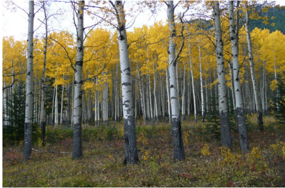
"Standing Tall, Standing Together"

It seems like "change" is the word we are all getting our fill of these days. Even the trees are changing. Well, this month we have our own "change"; the changing of the guard with a new club officers and board members. Hopefully, we can live up to your expectations and make this change a "fun process" in the coming year.