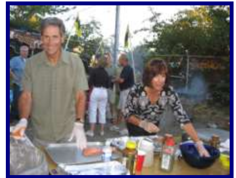
and eager assistants...