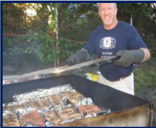
MUKILTEO'S IRON CHEF