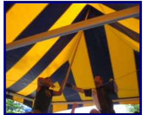
The Tents go up...