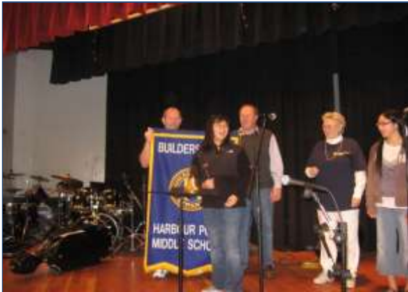
received their banner, gavel and bell at Annual Pancake Breakfast